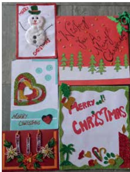
Christmas cards sent to the CGEF from Pakistan

The CGEF will sponsor girls regardless of their religious or cultural background, so it was lovely to receive such a heartfelt gift in return.