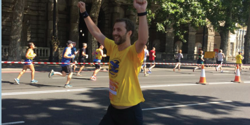
CGEF 10K Run

The Commonwealth Secretary-General Rt Hon Patricia Scotland QC and Their Royal Highnesses the Duke and Duchess of Sussex also attended the event to mark Prince Harry's appointment as the Commonwealth Youth Ambassador.